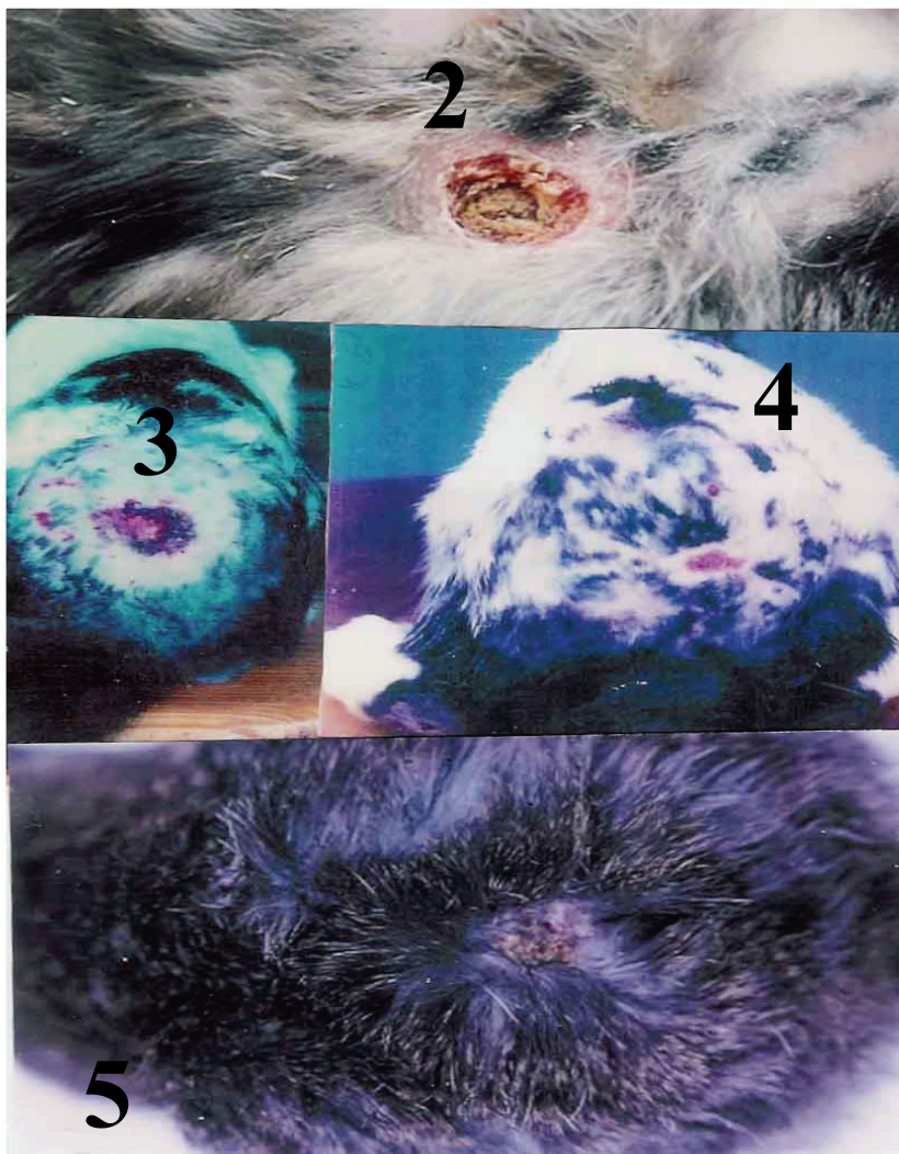
Plate 1. Showing burned skin of rabbits after topical application of treatments, 2: Untreated burned skin, 3 and 4: Treated burned skin by antibiotic Baneocin - Zinc and 5: Treated burned skin by NSO.

some hair roots were also grown. At the end of experiment, the burnwounds which were treated by both antibiotic and oil of NSO slightly restored their normal architectures.